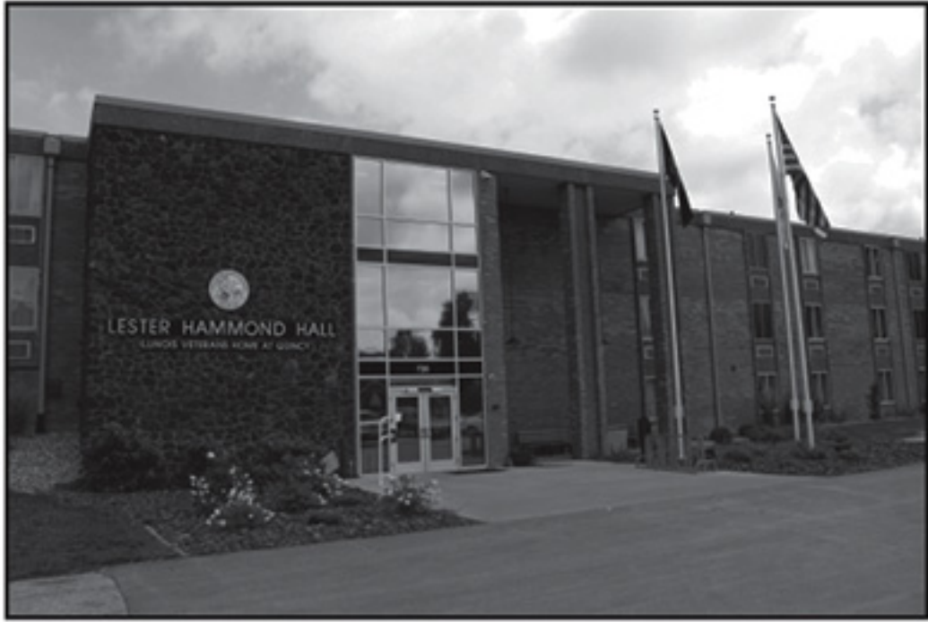
720 Sycamore Quincy IL